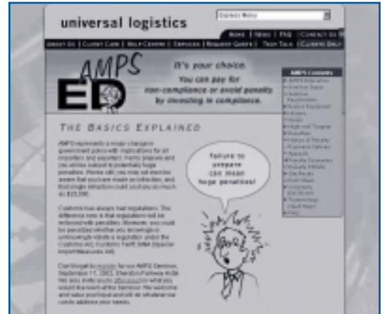
A second source of AMPS support was the all-new AMPS section of our web site ( www.universallogistics.ca ), located under Clients Only.