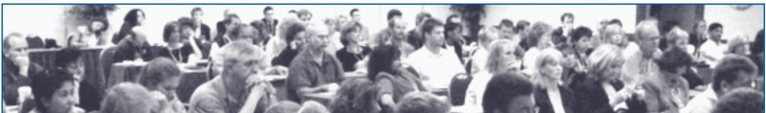
The full house underlined the high interest in AMPS, the single largest change in customs regulations in over a quarter century.