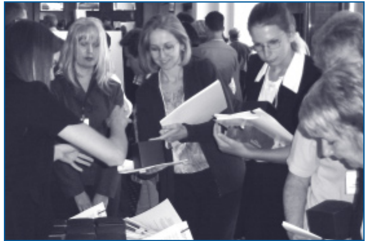
Seminar participants pick up their parting gifts and highly prized Certificates of EDification!