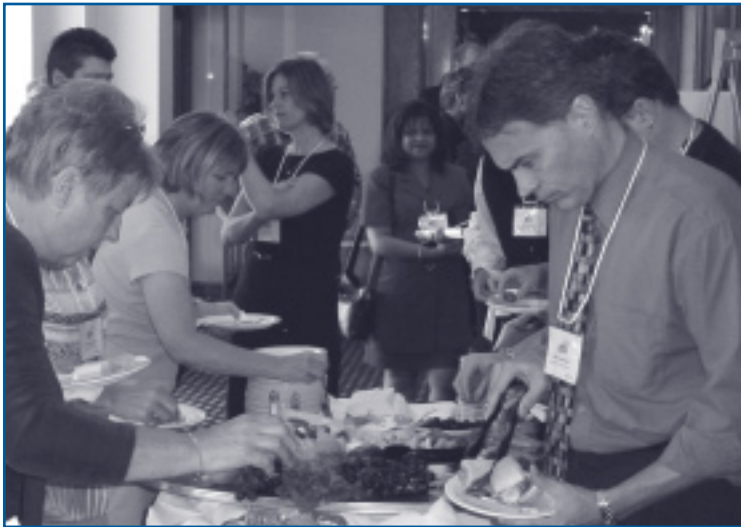
After the seminar, clients enjoyed a complimentary lunch.