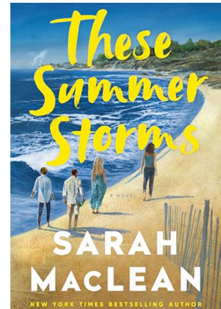
These Summer Storms by Sarah MacLean